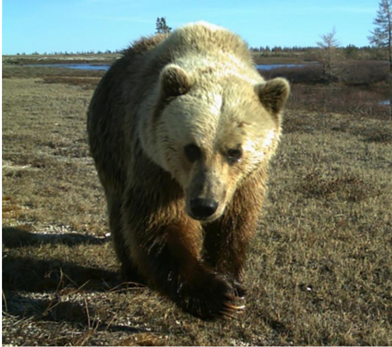
Hudson Bay grizzly.