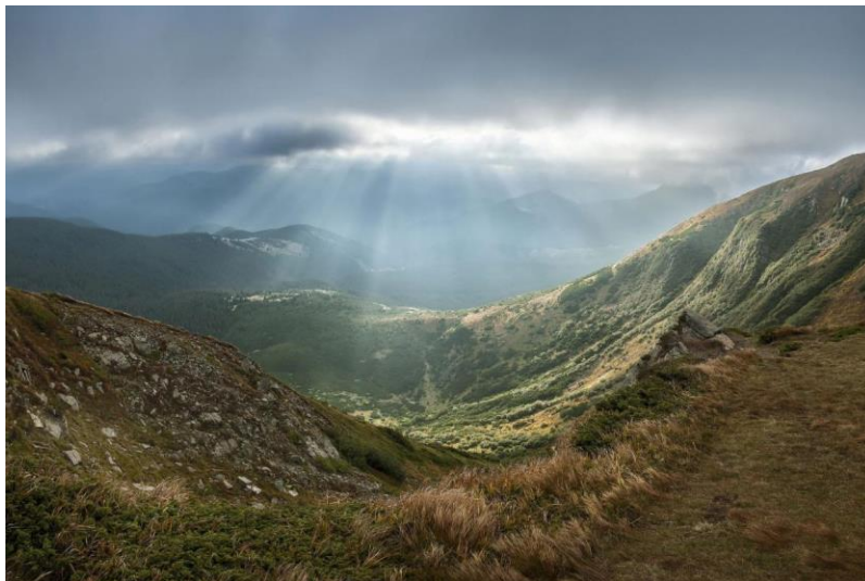
Carpathian Mountains, Ukraine